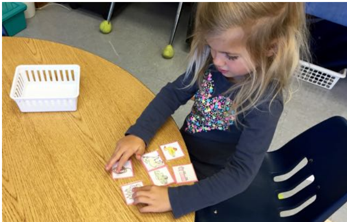
Language: We learn about rhyming by sorting cards smooth and bumpy edged and then we match the image on a smooth edged card to an image that rhymes on a bumpy edged card. Cake/Snake, Sheep/Jeep, Truck/Duck to name a few.