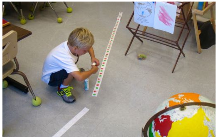
Math: Pre-K students do lots of patterning. They had the option of adding strips in order to continue their pattern. Concentration, coordination, independence, sense of order.