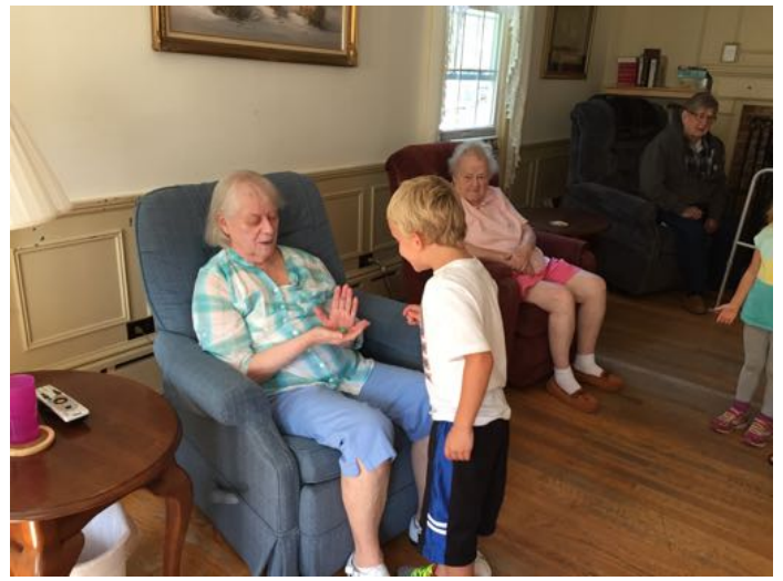
Our visit to the Island Commons included music and movement and a the game, "Who has the..."