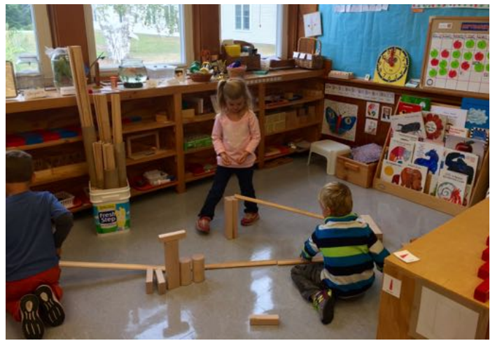
Physical Science: They have been engineering pathways for marbles with ramps and blocks. Fun to watch them explore and improve upon the process to get the desired result.