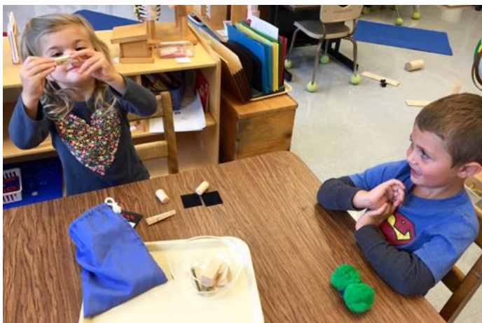
Sensorial - Using just their sense of touch they reach into the feely bag to find the match to the object they chose from the bowl. No peeking...