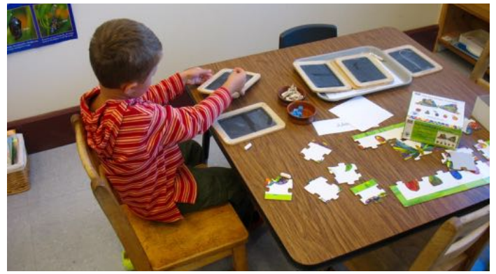
Language/Fine Motor: Practicing letter writing. We use the program Handwriting Without Tears.