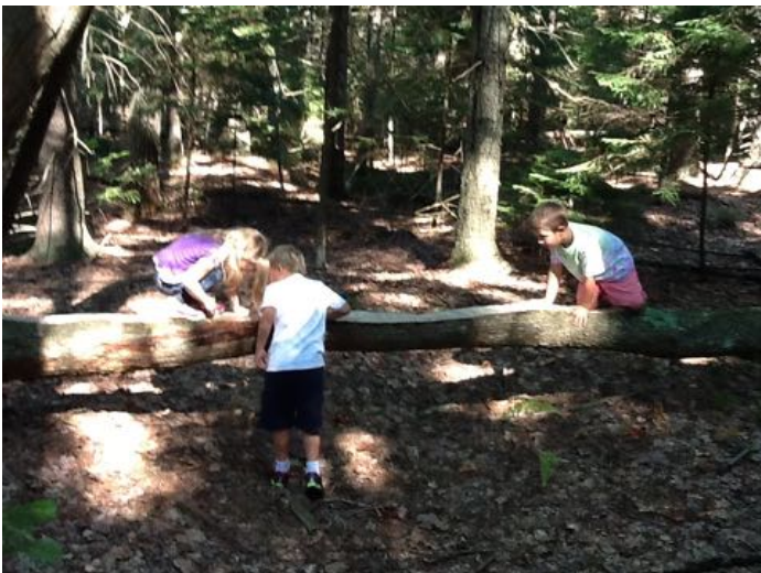
On Friday the 18 th we went on a trail walk behind the school. Each child found and photographed a living thing to add to our living/non-living picture sort. Here they are enjoying practicing their balance skills. Later along the trail they met the "talking tree". Ask them about it!