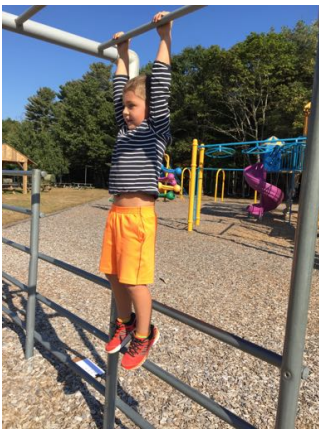
The playground provides lots of opportunities for them to grow their core strength and to challenge themselves.