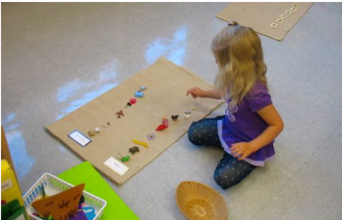
Cultural/Science: We have been learning about Land/Air/Water and Living/Non-Living. This sort is a group of objects, half of which represent something living, and the other half non-living.