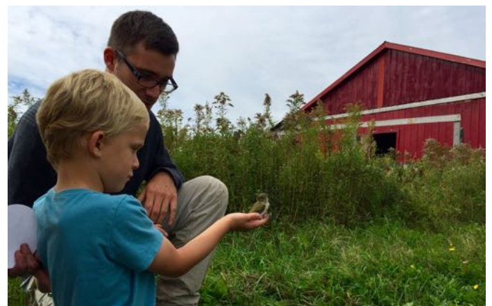
Friday we had a special field trip with our K-5 friends. We learned how and why they tag birds. Once weighed, measured, tagged we had the opportunity to help with their release.