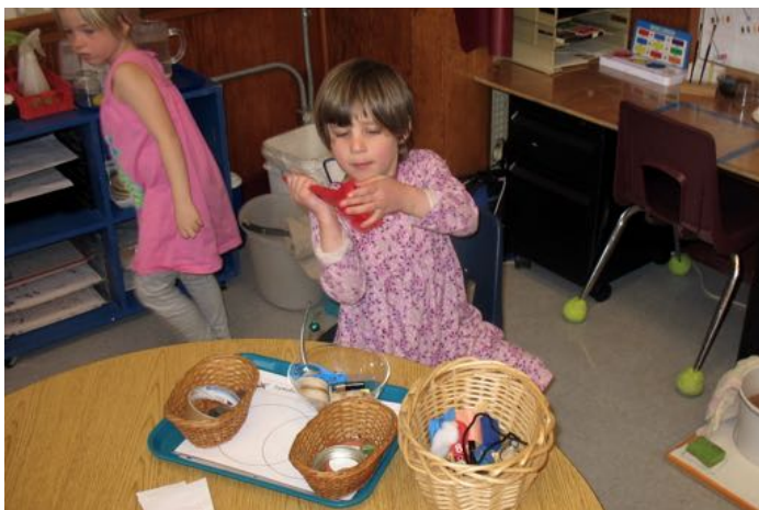
Physical Science - sorting of magnetic/non-magnetic and both - Venn diagram