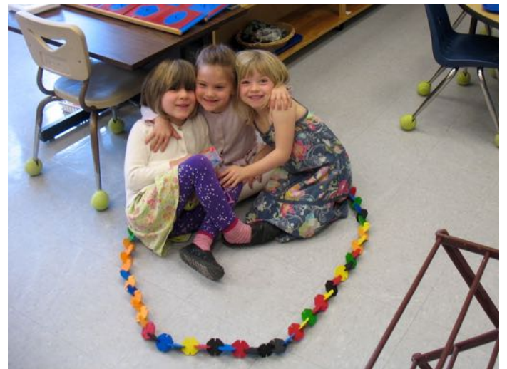
After working together to squeeze the foam octagons together into a chain they did this. Typical of this group. Sharing is caring.