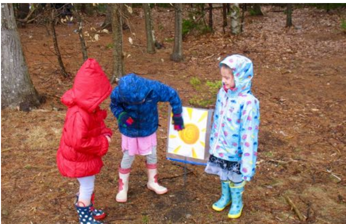
"The first will surely help me wake. It's cold in here for goodness sake! I must warm up and feel the light - Take me where it's warm and bright" Off they went to find a poster of the sun.