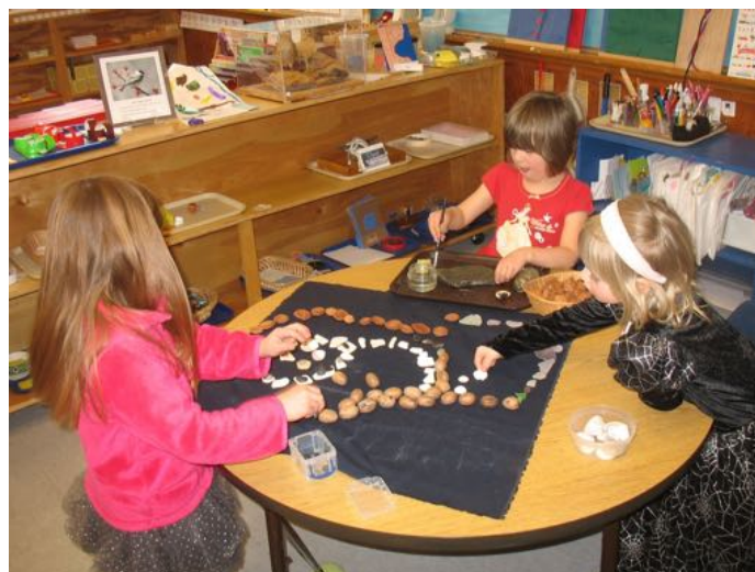
The warmer weather inspired some nature art. Each child did their own design from which we did some variations and extensions. We also used our cooperation skills to create a design together.