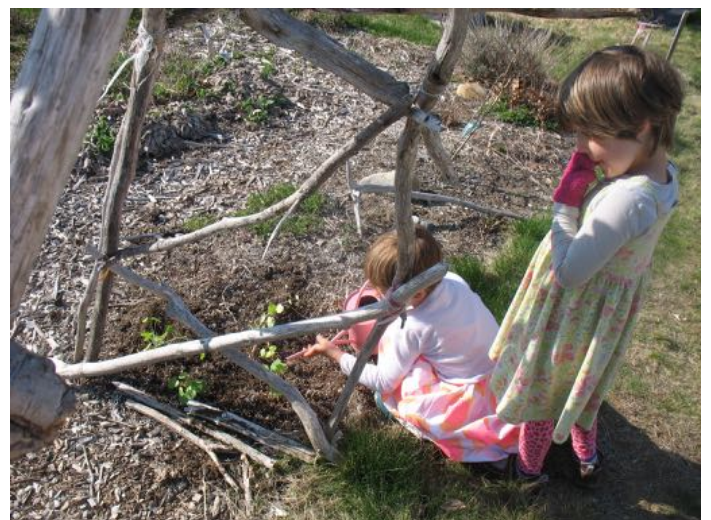
They successfully grew nasturtiums from seed for their mother's day gift. They planted the extra ones next to the entry trellis of the "squiracle" garden (which is actually neither a square or circle)

Thank you for sharing your children Miss Nancy