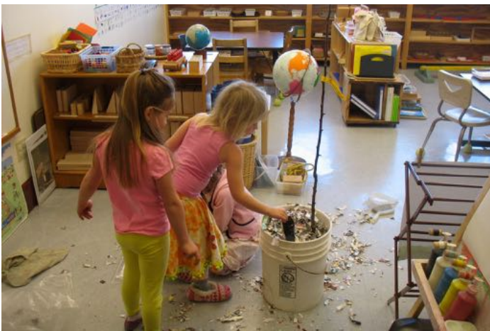
The replacement tree apple for one that was girdled by mice arrived just before spring break. The long box inspired some great wonder about its contents. We soaked the tree overnight and the following day did a riddle hunt for the fab five things that plants need to survive which cumminated in planting the tree.