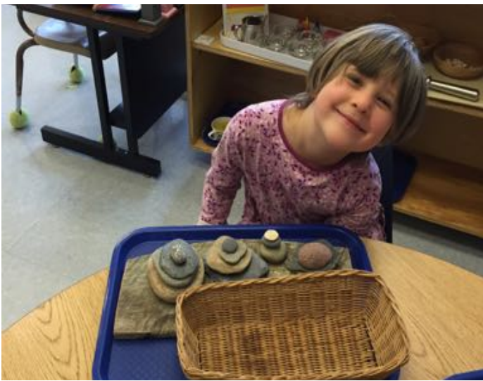
Fine motor & Art: Nature trail cairns in miniature.