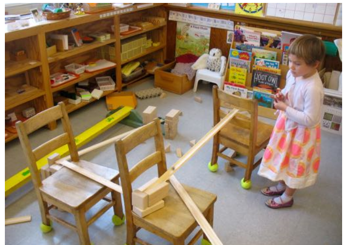
Physical Science - ramp explorations - cove molding and marbles.