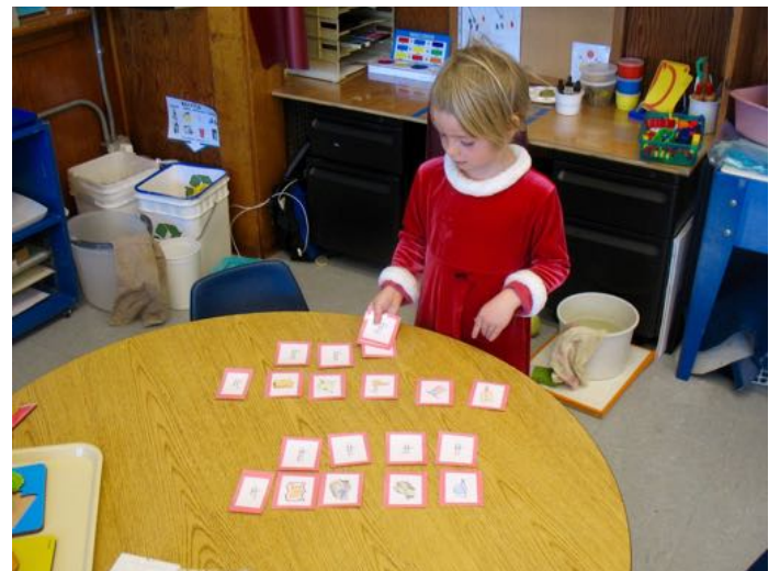
Language - we continue with our sorting of letter sounds and have added sorting by ending sounds.