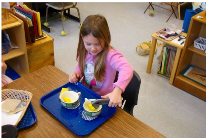
Practical life - squeezing: garlic press and sponges - they squeeze out the water.