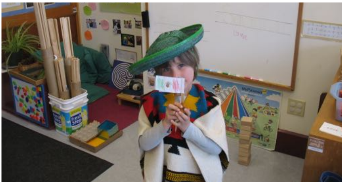
Cultural Studies - Cinco De Mayo - flag making An opportunity to discuss history