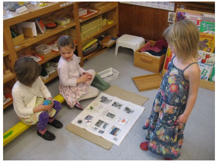
Rachel Carson is our current peacemaker. This matching work retells some of her life story.