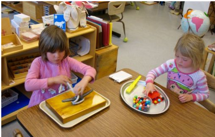
Practical Life - twisting cleat work Physical Science - exploration with magnetic spheres