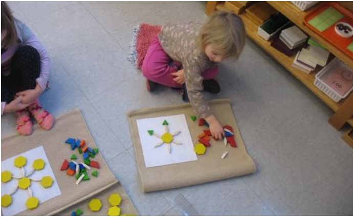
Radial symmetry studies inspired by snowflakes: We viewed some Bentley snowflake images and noted that they were all unique. They then went about making their own designs, first with the wooden pattern blocks, then with paper cut outs.