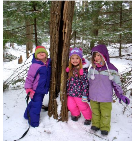
Forest Friday fun at the "talking tree". We have found tracks of deer, hares, and humans.