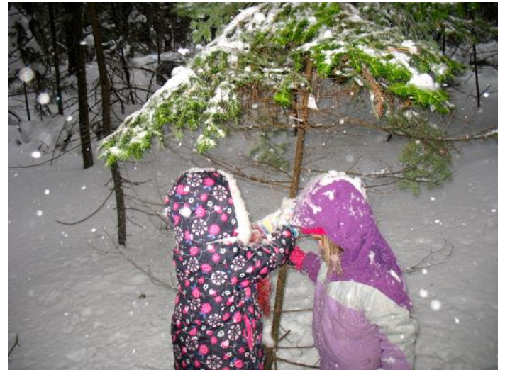
Last Friday we tried out snowshoes, which was hard work but lots of fun. There were many trees with "snow plops" to share.