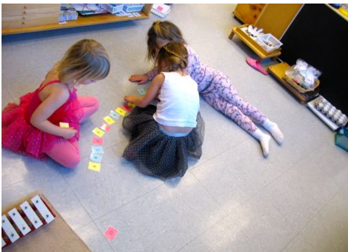
Making a musical alphabet snake (A-G). They all love making glissando's on the xylophone.