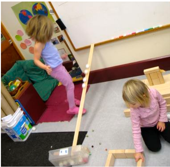
Simple machines: Beginning exploration of ramps,