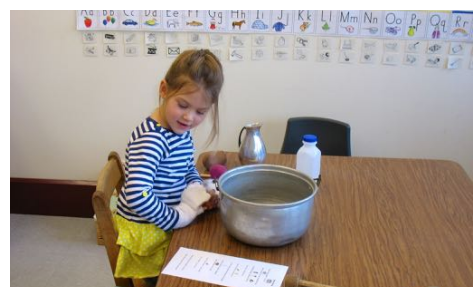
Stone Soup retelling, "bring what you've got".