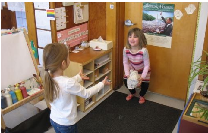
We are learning that a good toss is one that your friend can catch. Here they are doing rainbow tosses using a trash ball (taped up newspaper). They have the choice of two other balls as well. The tossing area is the black entrance mat for obvious reasons.