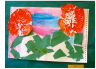
Our cabbage print collages. This work involved printing, cutting, watercolor, tearing paper, gluing, story telling and lots of fun.