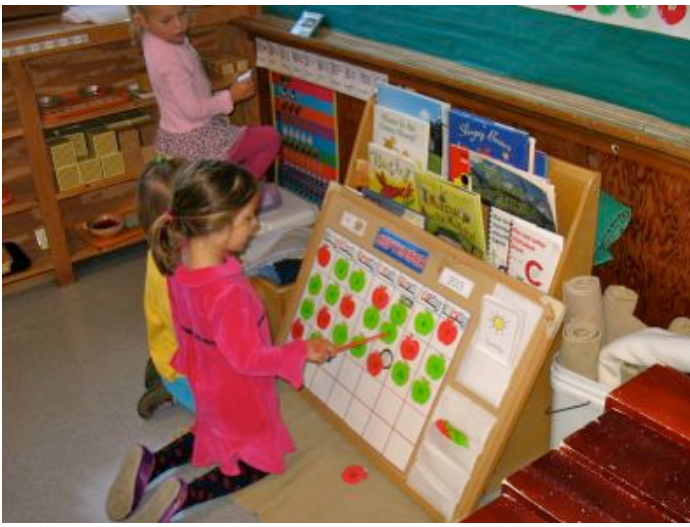
The morning morning calendar job provides practice in pattern and counting