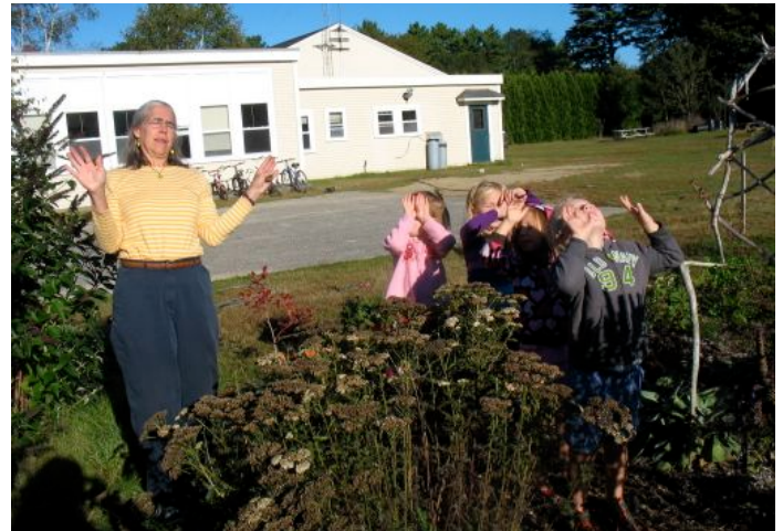
Singing our six plant parts song. Here we have turned our "leaves" (our arms) to gather sunlight.