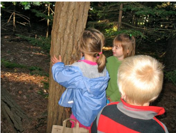
The talking tree is a favorite stopping point on the nature trail.