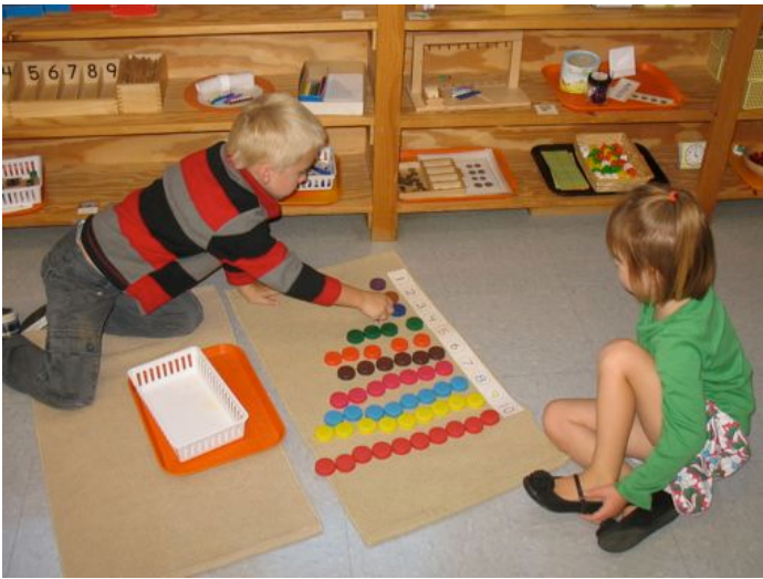
A sets basket: sort, count and associate the group with the correct numeral.