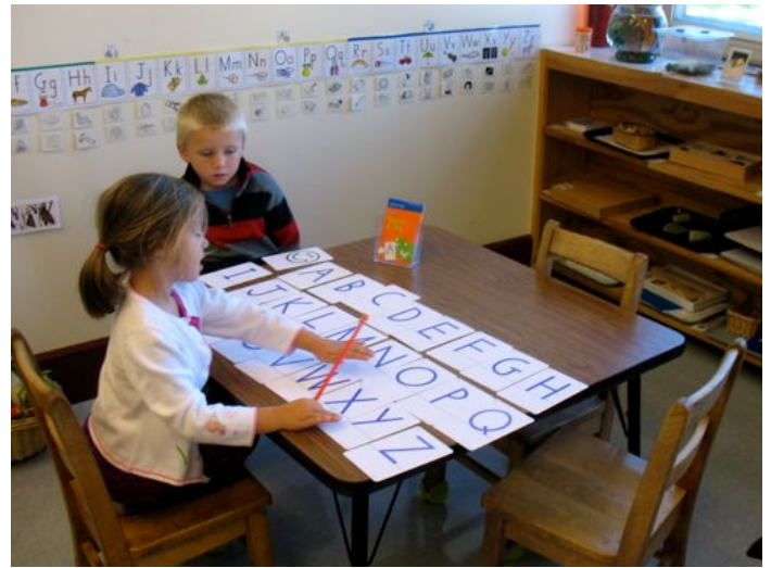
Cards flipped, ready for ABC's