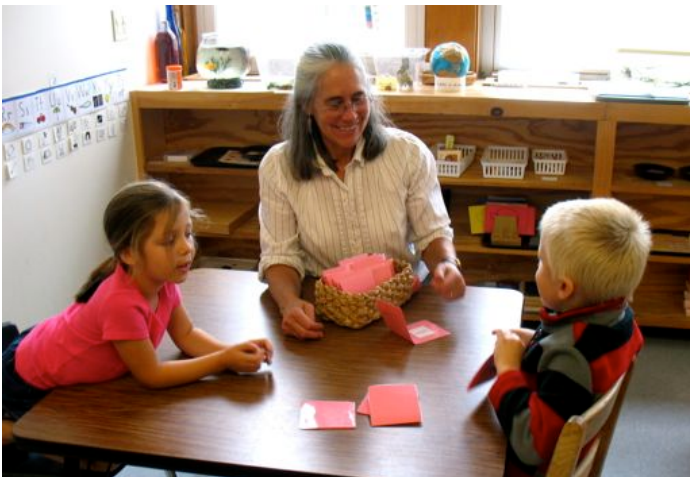
The little pink books have one picture and one single syllable consonant vowel consonant word. They get so excited to read these one page books.