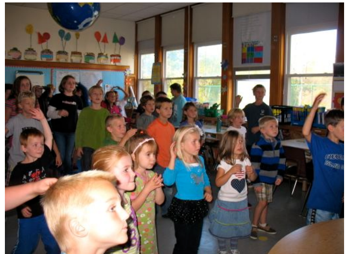
Virginia had all CIS students came together for the national move it minute.