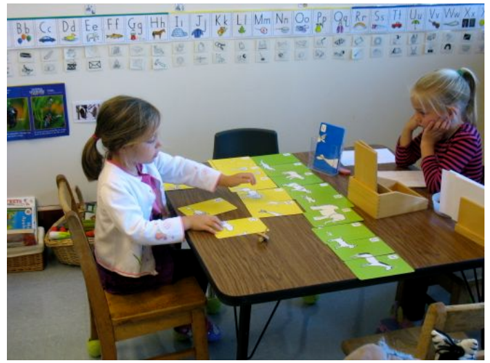
First sort the cards by color, then match animals tail to their bodies. Once all three colors are done, flip them over any you can say your ABC's.