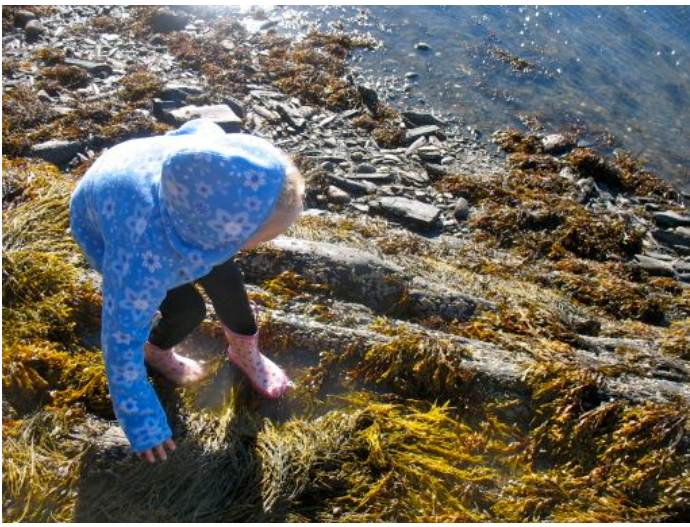
The entire school went to Bennett's Cove to look for specimens for the school tank. We came home with lots of green crabs and snails