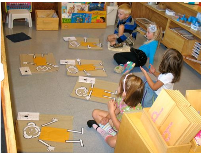
Handwriting Without Tears mat man. Mat man helps children to include more body part when they draw pictures of people. We also use the pieces (big lines, little lines, big curves, little curve in constructing upper case letter.