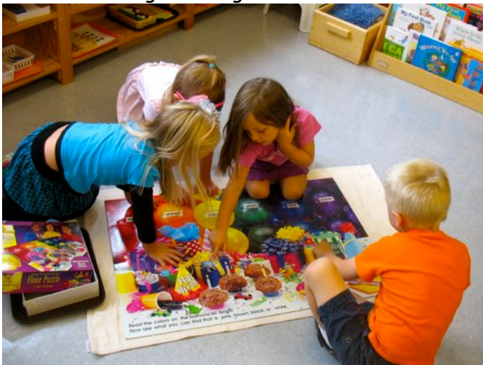
Cooperative puzzle play