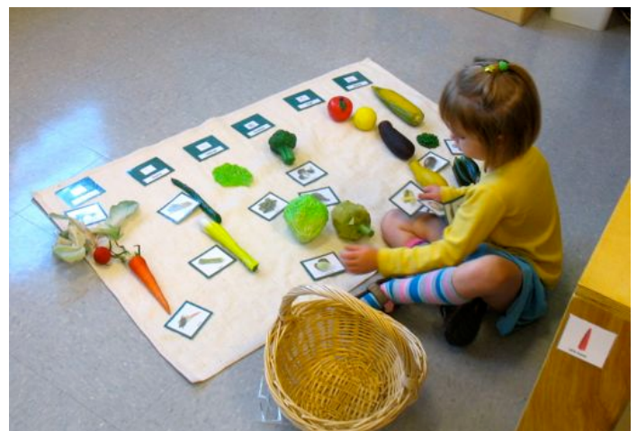
Doing a sort of the six parts of a plant: Roots, stems, leaves, flowers, fruits, seeds