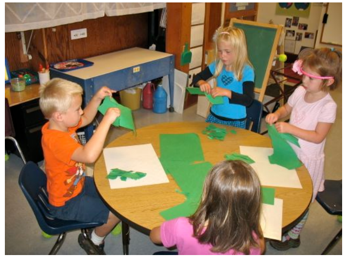
Learning how to tear paper for our collage