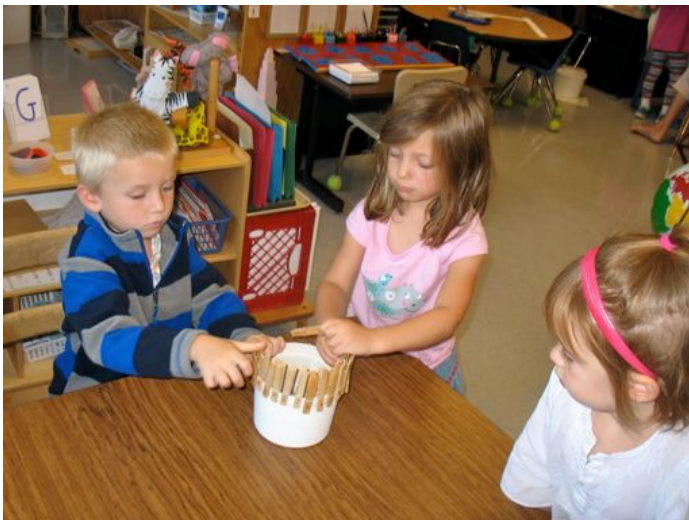
Working together to match lower letters (on the clothespin) to their corresponding upper case letter on the rim of the container.