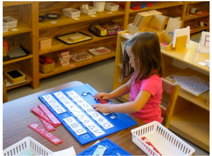
Manipulock - shape matching to their inverse - Great visual discrimination exercise and takes concentration