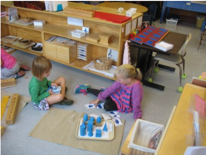
Geometric Solids exploration. They love to hide one solid under a cloth and say..... "Abracadabra, Sis, Boom, Bam, Geometric Solid, Won't You Scram... What's Missing"