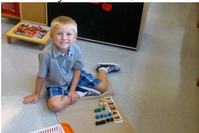
Sequencing numerals, sorting and counting