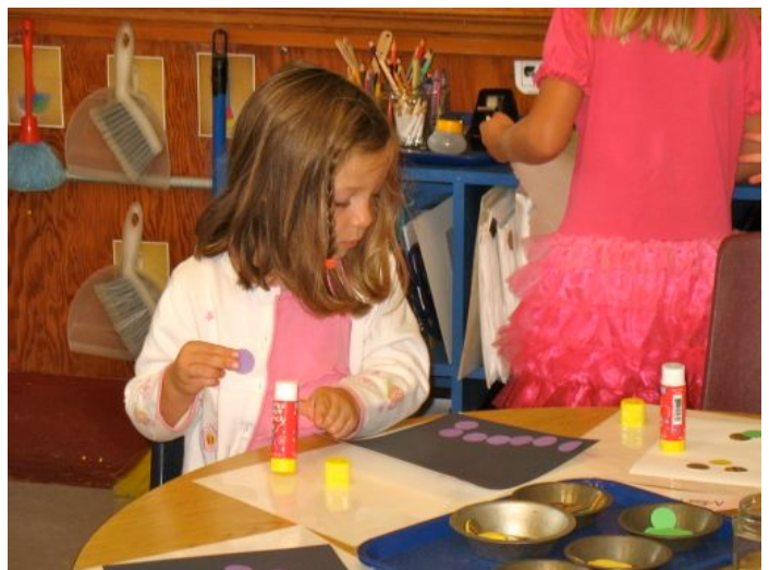
Using a glue stick - fine motor, concentration