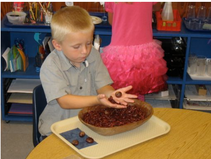
Scooping beans and finding the hidden chestnuts