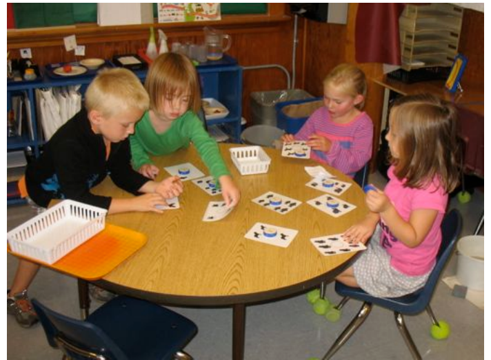
Counting game: matching numbered bottle caps with the appropriate card