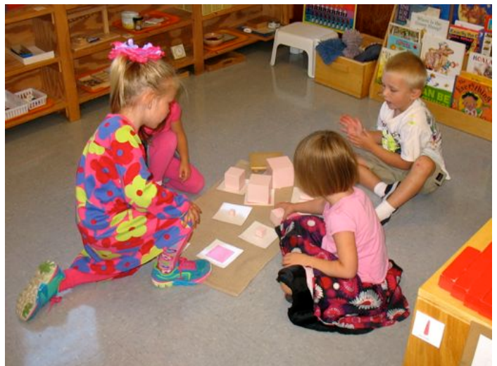
Visual discrimination - matching cubes to cards