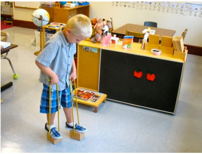
Gross Motor - exploring stilts