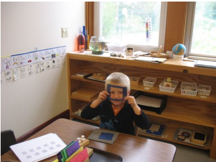
Pin Punching a square - Child commented "Sponge Bob Square Pants"