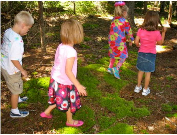
The mossy area is always of interest on the Nature Trail