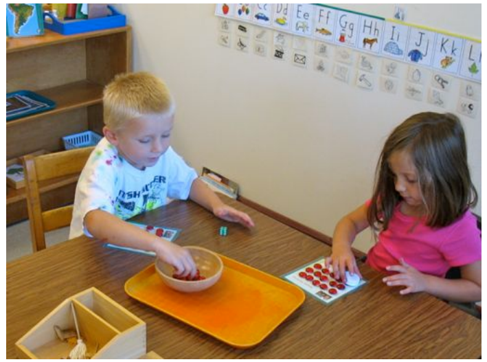
Apple Counting Game: Roll a die, add that many "apples" onto your card. We always wait for our partner to fill their card too.