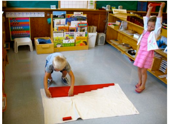
Sensorial - the red rods, grading long to short