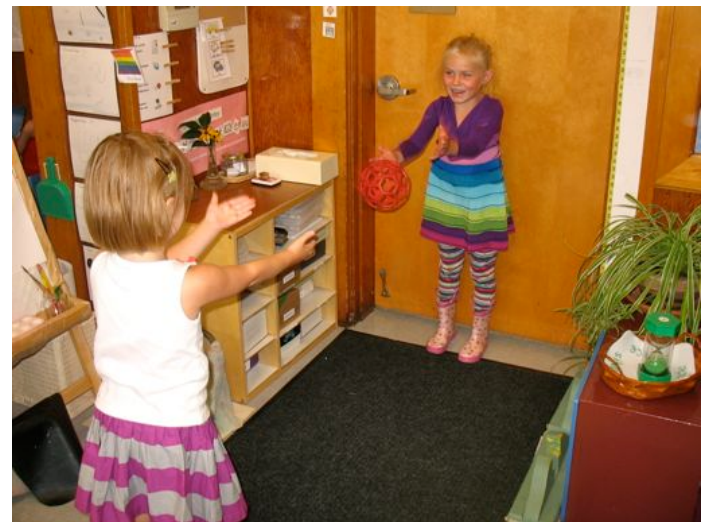
Gross Motor: Ball Tossing - "A good toss is one your partner can catch"