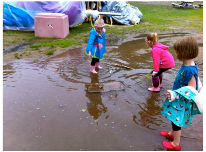
Plywood floats, even with rocks added