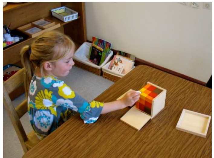
Cube of the trinomial puzzle: Refinement of the ability to compare, discriminate, decide, problem solve.

We then moved over to the raised beds and weeded the asparagus. This also included a taste test (mmm good) and some worm observations. Here they are showing off their "buckets" of weeds.