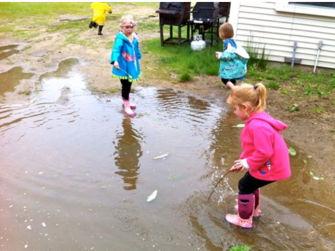
Sticks - float

Friday recess provided some exploration opportunities about float and sink. They were a blast to listen to as they posed questions and then tested them out. They started out with leaves, flowers and sticks and then progressed to a plywood board to which they added stones and eventually tested out standing on it. Thank you for sending them with footwear that enables wet play. ☺ We will always go outside unless it is pouring.