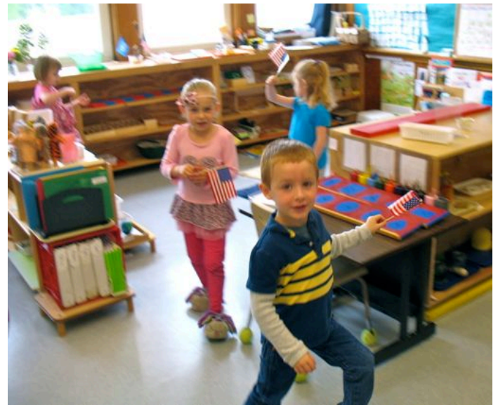
During first circle on Thursday we talked about Memorial Day and marched around the room to March of the Wee Americans and Stars and Stripes Forever . They had some interesting comments about why people should not fight.