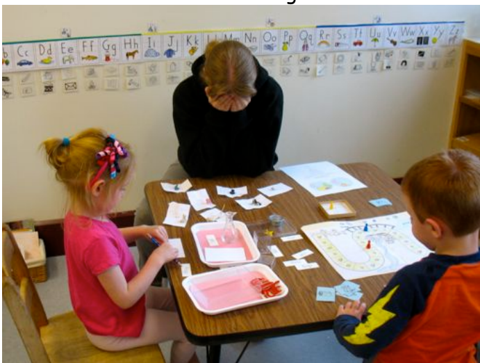
Secret word: Phonemic (mostly 3 letter) objects are matched with their word. You take turns secretly writing one of the words, fold it up small and share the "secret message" with your friend to read. They love this game.