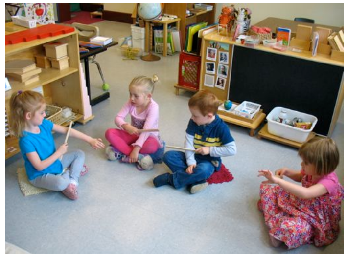
Thursday's music circle was about string instruments and included a violin demonstration. Here they are practicing bowing. They each got to try plucking the violin. My playing Twinkle on the violin is marginal so I shared a 7 minute U-tube of Beethoven's Fifth that zooms in on different instruments. They asked for a replay.

Leo Lionni is our new author and Black Elk is our new peacemaker. As a child Black Elk had a vision about the four directions of the world and how all the creatures were interconnected. The work in the classroom includes the 4 directions, a path of difficulty, and a path of peace. It was just presented on Friday. I hope someone revisits it next week.