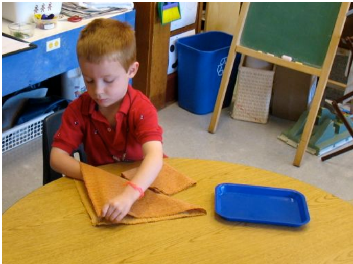
Napkin folding: Fine motor, concentration, also promotes awareness of symmetry

We continue with our classroom routines. Some have been exploring time to the hour. Spring has enabled a number of works relating to care of the environment.