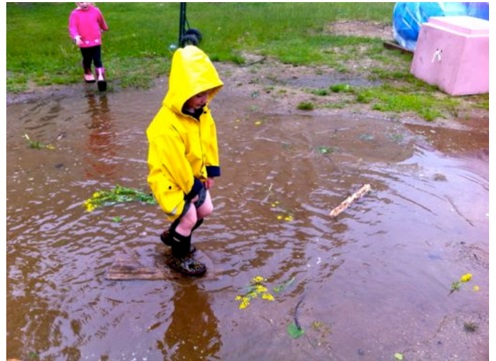
Plywood sinks when I stand on it