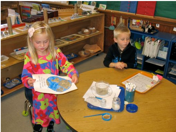
Earth maps made with crayons, sand and glue - revisiting that our earth is made up of land, water, and air all around.