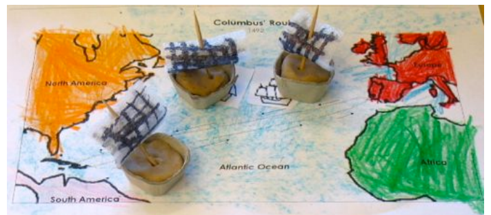
We talked about Columbus and colored maps; each child made three ships with sections of egg cartons, play dough, toothpicks and rectangles of foam. They liked having the Santa Maria sink ☺.