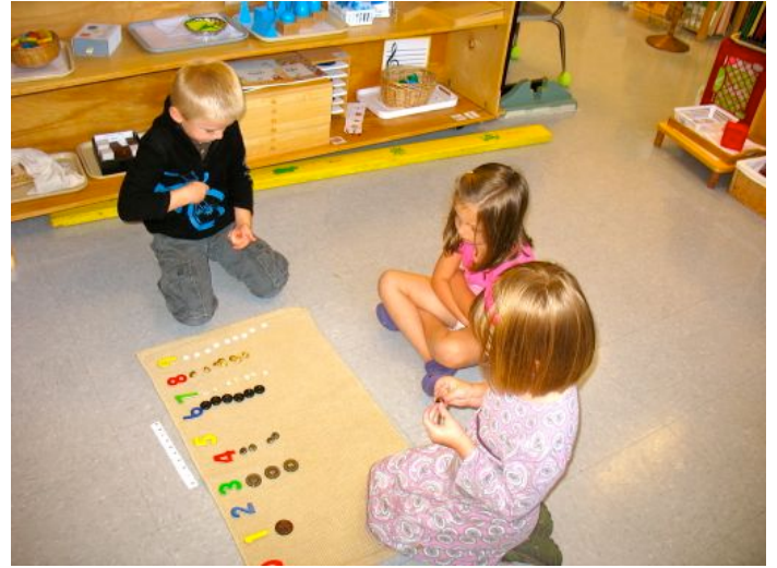
A sets basket of buttons. When items dissimilar in size are used it helps them to see that 3 is still 3 even if it is as long as the group of 4.

lighter, same as, equal, balance. We were comparing the weight of two apples and then trying to equalize their weight with fava beans.