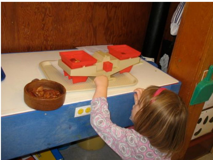
Part of learning about measurement is learning about the different tools used to measure things, and all the associated vocabulary: heavier,