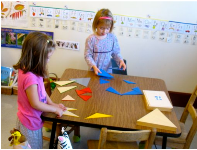
Exploring some of the constructive triangle boxes. The triangles can be put together to make more triangles and/or other geometric figures.

lighter, same as, equal, balance. We were comparing the weight of two apples and then trying to equalize their weight with fava beans.