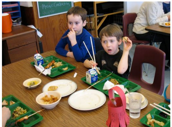
Chinese New Year lunch