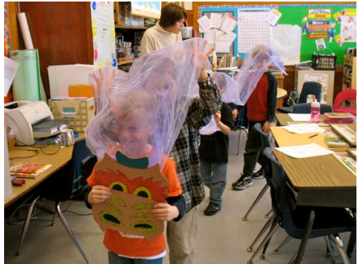
The dragon dance