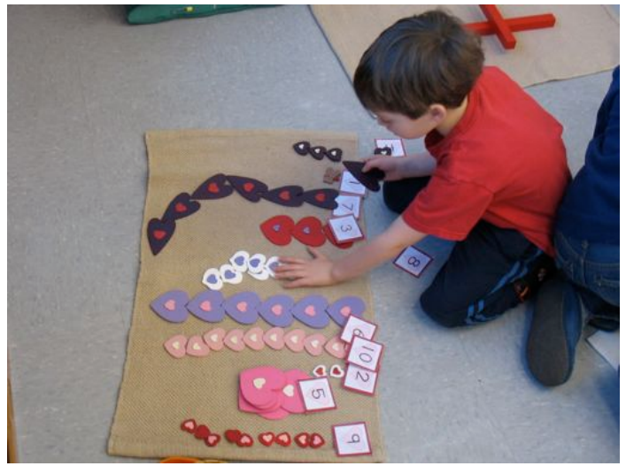
Valentine sets basket

March 16 - K-5 Field trip to NOAA weather station