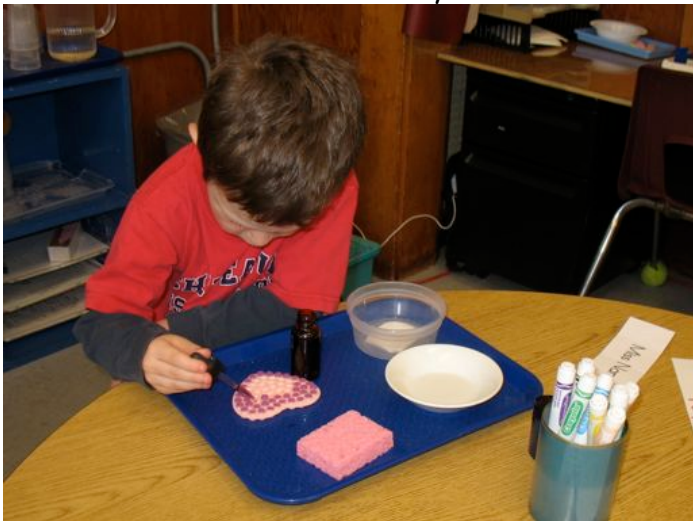
Squeezing pipette - fine motor exercise