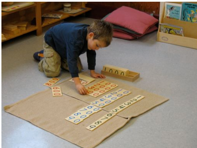
Sequencing numeral cards in place value groups