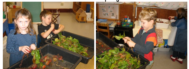
Removing the stems and leaves