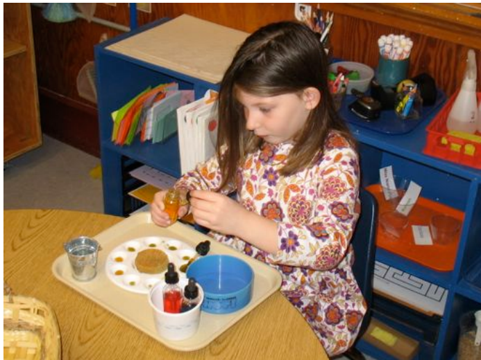
Exploration of color mixing