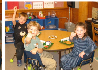
Slicing, trying them raw, eating them cooked at lunch