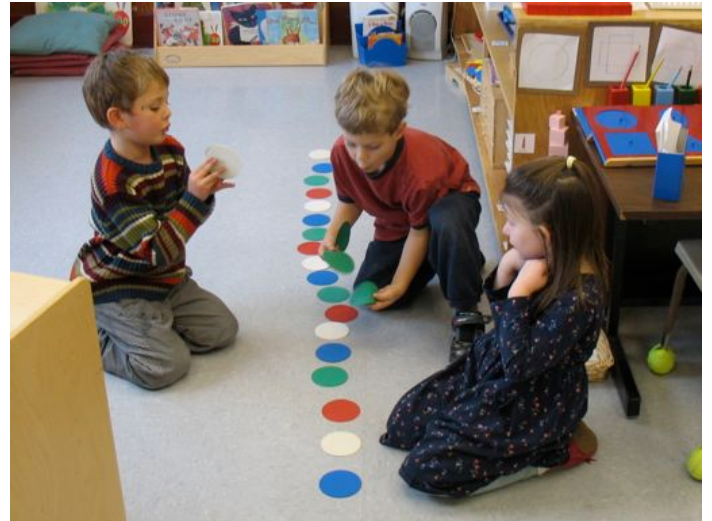
What comes next: white, blue, green, red, white, blue, etc. We each had a color group patterning exercise