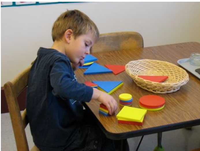
Sorting by attributes