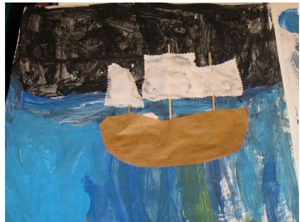
Mayflower horizon painting - this one is at night

Dec 17: 4:30 - 6:00 Tentative Holiday Concert