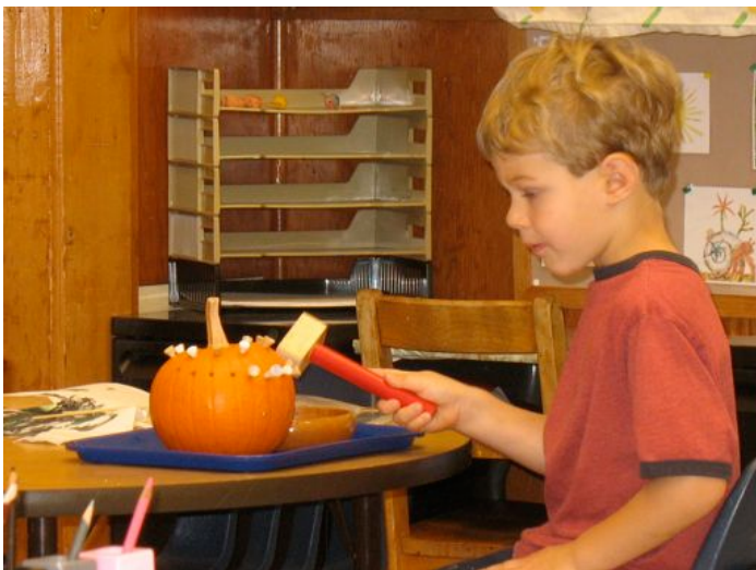
Hammering golf tees into a pumpkin - hand motor control. Try it, its fun