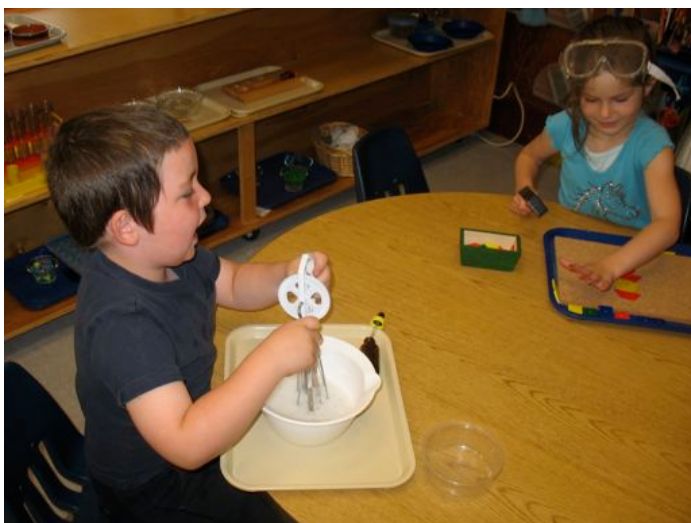
Twisting work - using a rotary beater to make bubbles (add water and add a squirt of liquid soap)