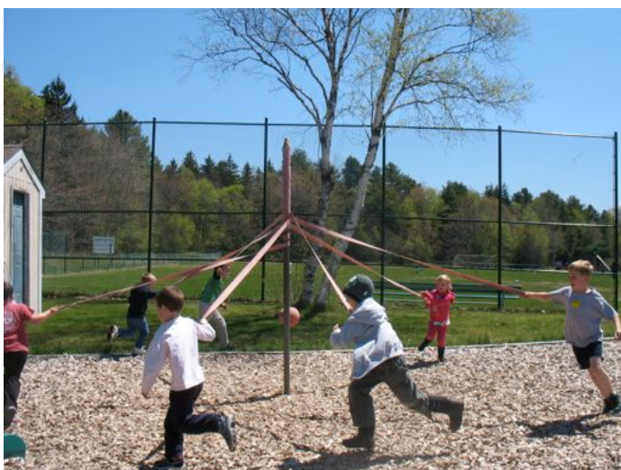
Because of rain we did our May Pole fun on May 3 rd . Here some K-2 children have joined in.