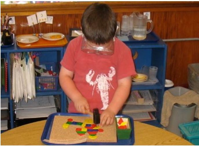
Hammering - various wooden shapes with little nails