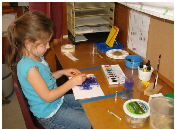
They wrote Mother's Day messages in white crayon and then painted over top to reveal their messages.