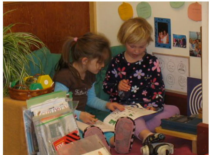
Friends reading together in the peace corner

Our new science unit is insects. They are enjoying the insect finger puppets, constructing an insect with parts from an old game of Cooties, playing cover the board with ladybug die, and weighing the different plastic insects (this time with beans instead of tiles).