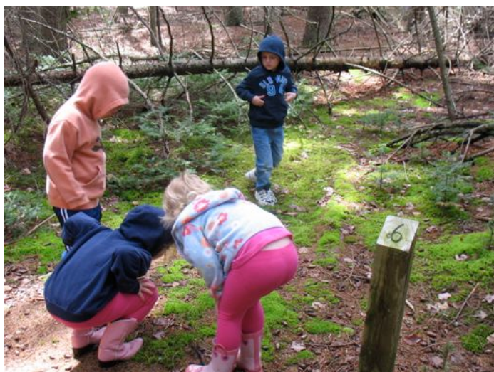
Admiring the moss during our nature classroom walk on Friday.