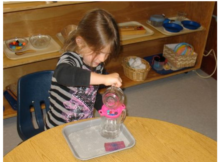
Pouring using a sieve (sifting beads)