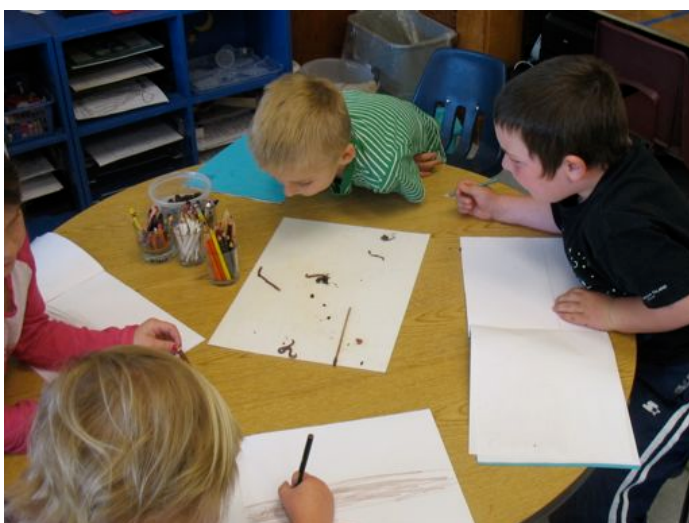
Earthworms were our journaling prompt on Friday.