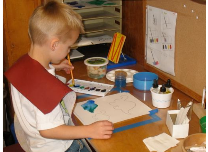
Painting dinosaurs for a collage project

with stones and one without. We rubbed them together to demonstrate the action of the stones in their stomach.