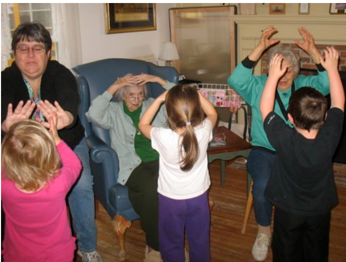
Playing the mirroring game with friends at the Island Commons on May 4 th . We did this to Pachelbel's Cannon in D. We started with the children leading and then switched. It was pretty magical.