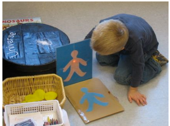
Heartlight Peace work. - when we make good choices and are treated with kindness our heartlights are bright.