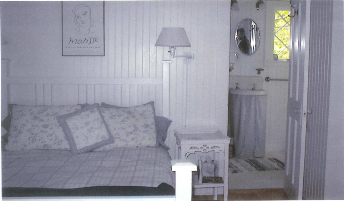
master BR & bath