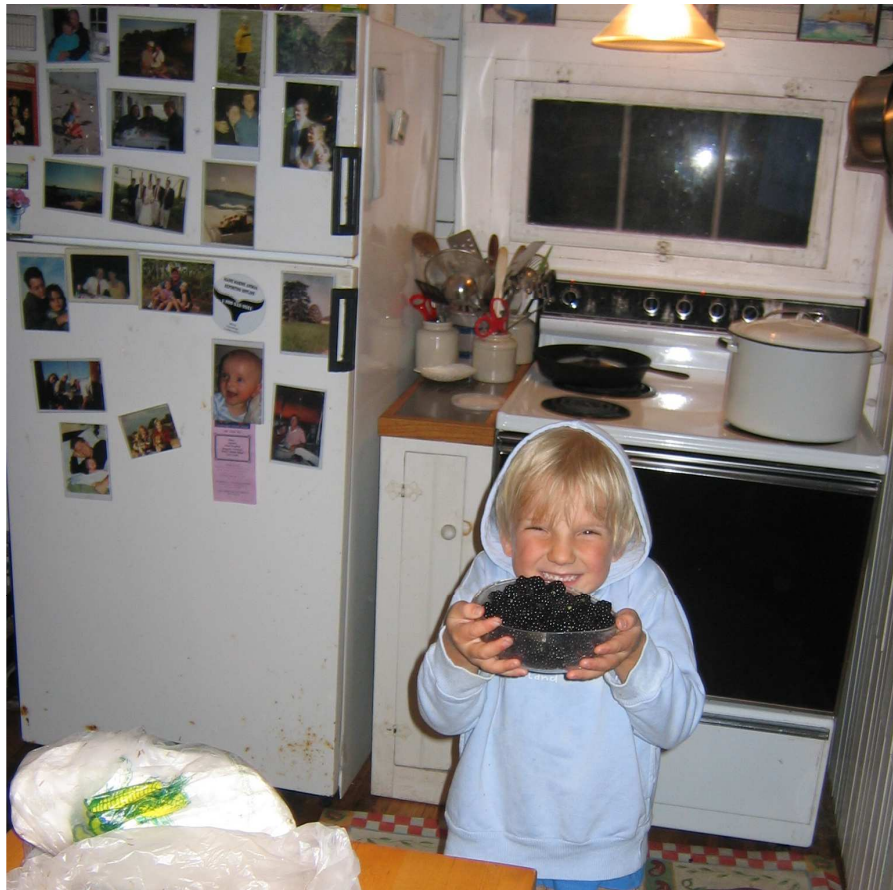
Kitchen before remodel