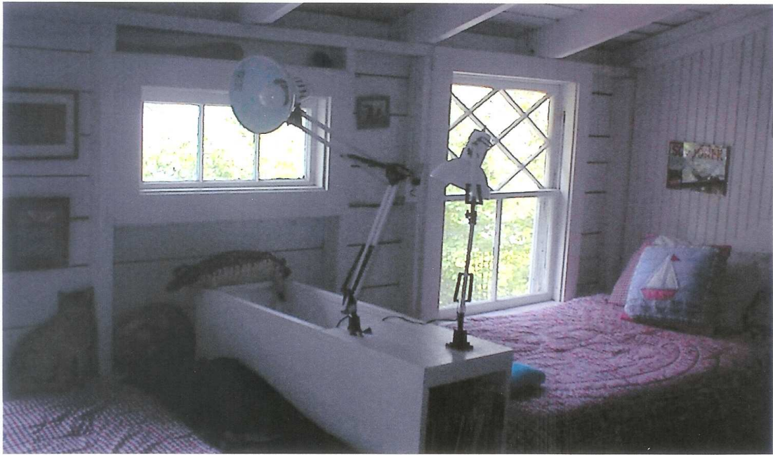
front BR 2d floor