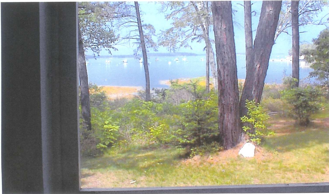
view from porch