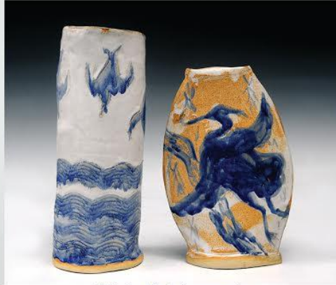
"Water Birds", ceramics